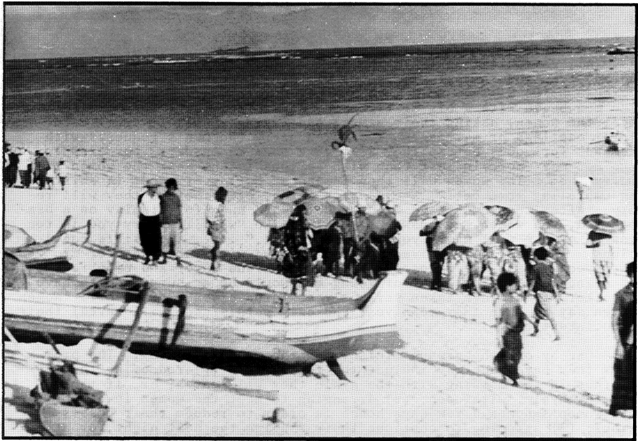
Plate 2. Men joining up with a group of women.