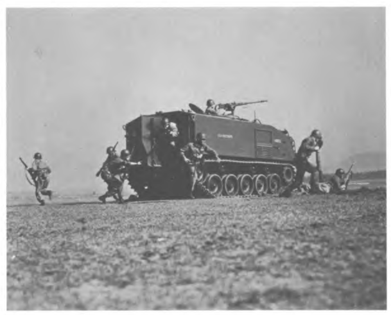
Cadets dismount from an armored personnel carrier during a tactical exercise.