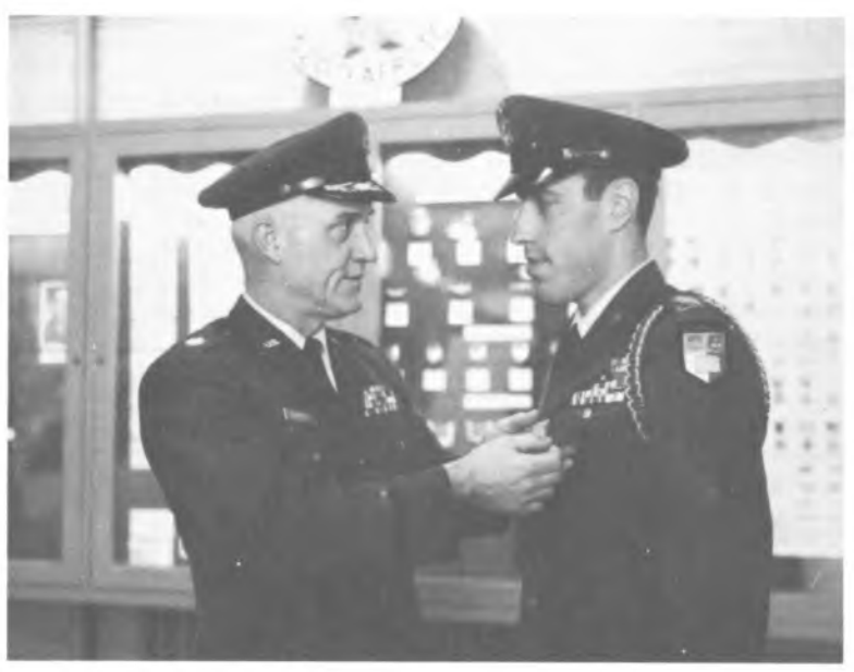
Presentation of the Distinguished Air Force ROTC Cadet badge.