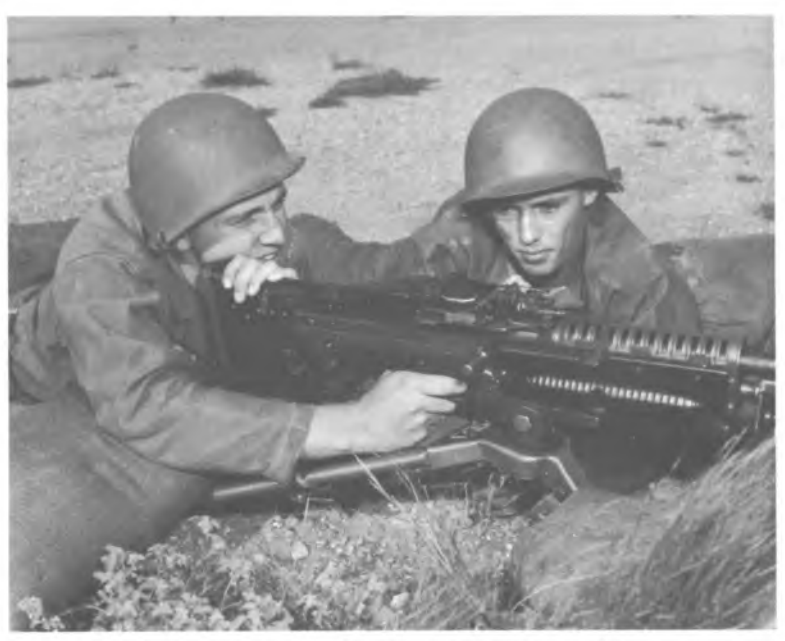
Weapons training with the Army's new M60 machine gun.