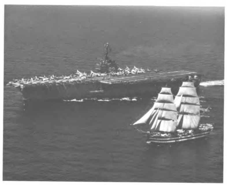
The new and the old.