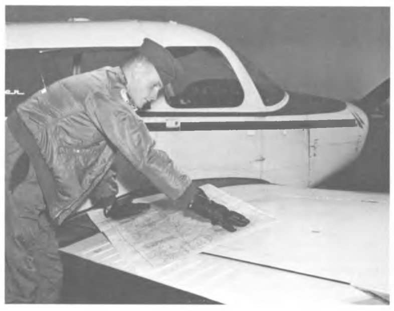
Air Force ROTC senior checks his flight plan before starting a solo cross-country flight.