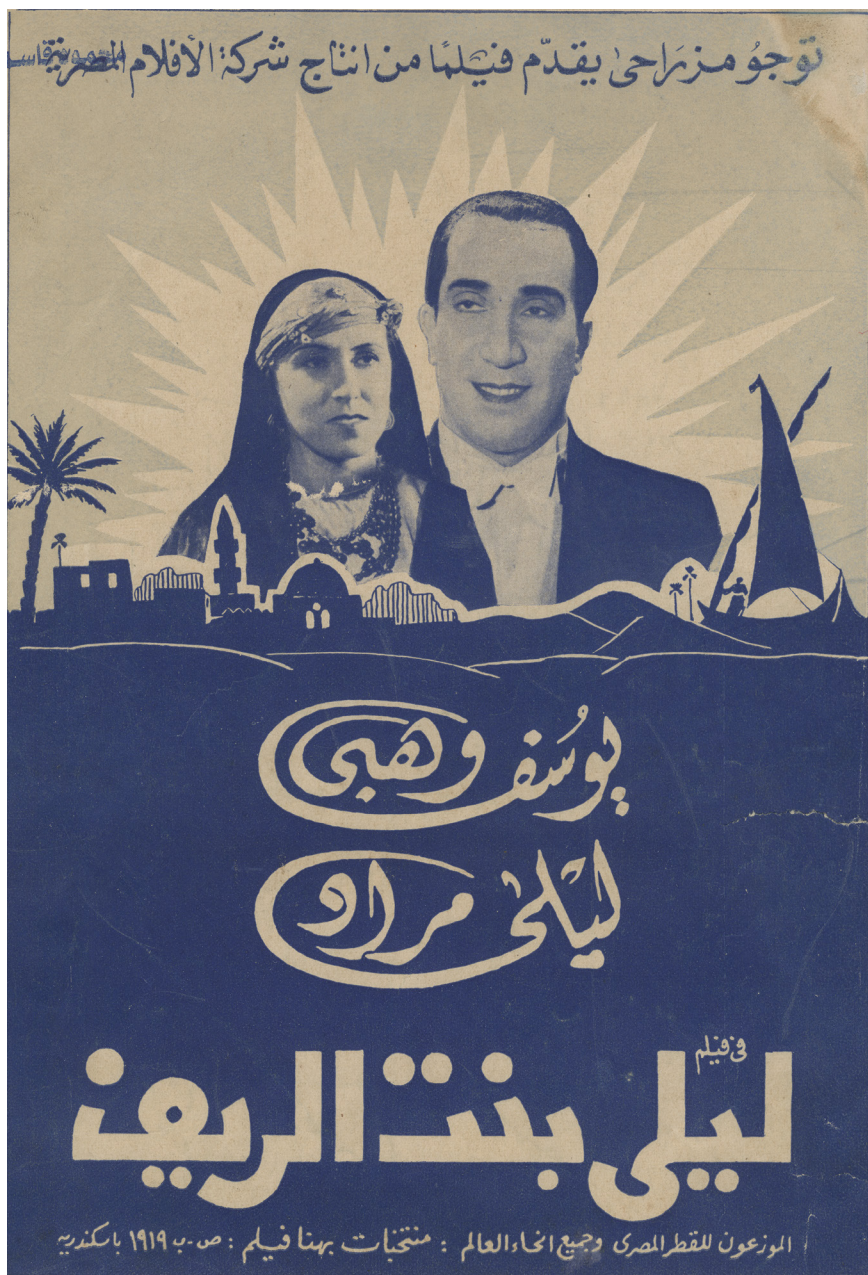
FIGURE 40. Pressbook for Layla the Country Girl (Togo Mizrahi, 1941).