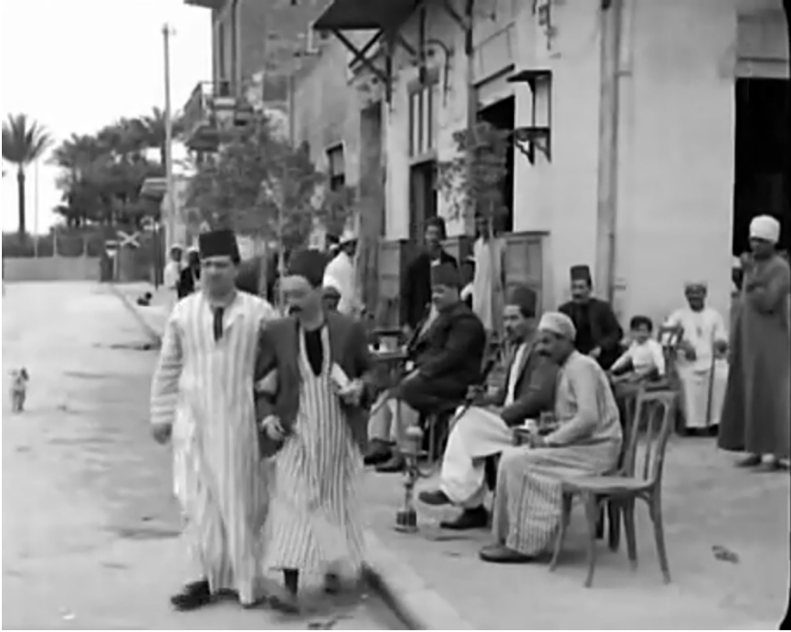
FIGURE 9. 'Abdu ('Abdu Muharram, left) and Chalom (Leon Angel) leave a café arm in arm. Screenshot from The Two Delegates (Togo Mizrahi, 1934).

Third, Levantine films foreground the performativity of identity. Plots of mistaken identity highlight the fluid and mutable character of identity as performance: they do not merely arouse laughs, as Abu Shadi contends. My analyses of mistaken identity and masquerade reveal the plot device's subversive potential.