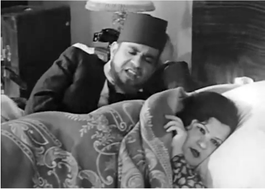
FIGURE 20. Farahat (Fawzi al-Gazayirli) and Umm Ahmad (Ihsan al-Gazayirli) in bed. Screenshot from Doctor Farahat (Togo Mizrahi, 1935).

Although the men remain fully clothed, physical contact between them in bed—like the sight of ‘Ali climbing over Farahat—elicits laughs. 9 By contrast with this scene, while the opening sequence of Mistreated by Affluence leaves no question that we are viewing a comedy, the fact that the two men share a bed is not played for laughs. Farahat and ‘Ali would, like their counterparts in that film, think nothing of sharing a bed with a male friend in their own cramped domestic quarters. The luxurious bed in the hotel is large and inviting, and despite the presence of a couch in the suite, neither character seems to question that they would share the bed. Farahat objects to the way ‘Ali enters the bed, but not to his presence.