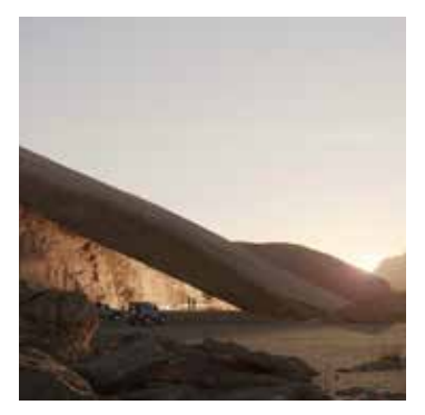
Figure 8. Mountain for the Red Sea Development Project.

The potential expansion of Saudi Arabia's tourism sector provides several challenges and opportunities. Among these challenges are the need to acculturate Saudis to