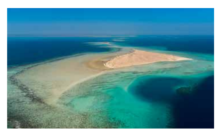
Figure 1. Pristine island in the Rea Sea archipelago (Photo Credit: Red Sea Development Company).

Since its restructuring, the PIF has made a plethora of moves to support Vision 2030. Investments outside the country have included a five percent share in the ride-sharing giant Uber, which is valued at $3.5 billion (Hook, 2016), and a $90 billion investment in the Japanese tech conglomerate Softbank (Hamilton, 2018). In Saudi Arabia, the PIF has backed several major projects. In 2016, the ownership of the King Abdullah Financial District was transferred from the Public Pension Agency (PPA) to the PIF ( Arabian Business ,