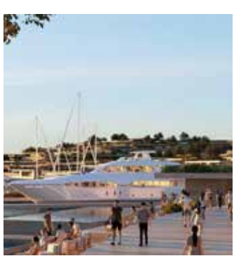
concept Figure 9. Marina concept for the Red Sea Development Project.