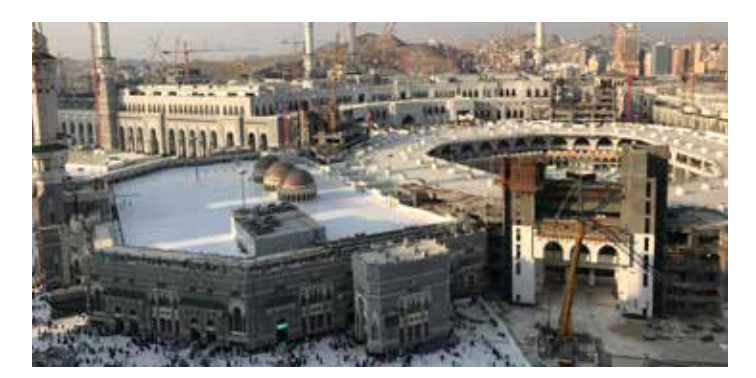
Figure 12. Renovation and expansion work in the Masjid Al-Haram in Mecca.

Saudi Arabia is already one of the world's top per capita carbon dioxide (CO<sub>2</sub>) producing countries, emitting 13.6 tons of CO<sub>2</sub> per person in 2009, which accounts for approximately 1.1 percent of global emissions despite representing ony