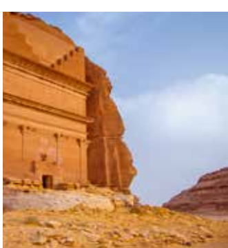
Figure 5. Mada'in Saleh a UNESCO World Heritage site; home of the ancient Nabatean Kingdom.