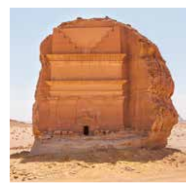
Figure 4. Mada'in Saleh a UNESCO World Heritage site; home of the ancient Nabatean Kingdom.

Coined the "Riviera of the Middle East," Amaala is a hyperluxury resort also along Saudi Arabia's Red Sea coast (News, 2018). Smaller than the Red Sea Development Project, Amaala is billed as an exclusive destination that will focus on wellness, healthy living, and meditation. The project is expected to create 22,000 jobs in hospitality