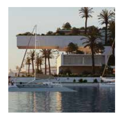
Figure 6. the Red Project.

The long-term strategy of Saudi Arabia is to make it inviting to the rest of the world. In the short term, however, it will continue to capitalize on its position as the birthplace of Islam and the site of the annual hajj which draws millions