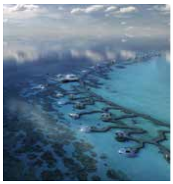
Marina concept for Figure 7. Island concept for Sea Development the Red Sea Development Project (Photo Credit: Red Sea Development Company).

of Muslims each year. Currently, religious tourism only accounts for two to three percent of the total GDP. With recent major expansion projects to Masjid Al-Haram in Mecca and the Prophet's Mosque in Medina, under Vision 2030, Saudi Arabia is looking to double the number of pilgrims making hajj and umrah to 15 million and 5 million, respectively, by 2020 (Kingdom of Saudi Arabia, 2016).