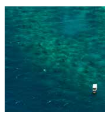
Figure 2. Dormant volcanos are a Figure 3. Arial view of the Red

architecture, design, technology, sustainability, energy and manufacturing (Neom, 2018). The company now has over 125 employees (LinkedIn) and has announced that it will start building homes in Neom Bay for completion in 2020 (Pukas & Flanagan, 2019).