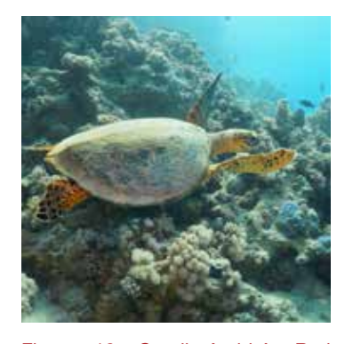
Figure 10. Saudi Arabia's Red Sea.

Currently, Saudi women make up only 0.03 percent of the total people working in the hospitality sector (Azhar,