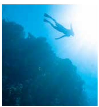
Figure 11. Saudi Arabia's Red Sea.

Duncan, & Edgar, 2014). This is in stark contrast to other countries where the hospitality industry has seen significant growth of female workers. In 2004, in the United States, for example, women and minorities accounted for 57 percent of the hospitality workforce with women comprising three-quarters of that number (Brownell & Walsh, 2008).