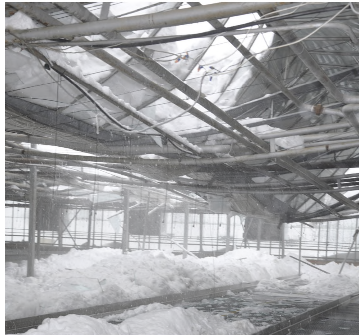
Collapsed Greenhouse in Western NY from the 2014 Snowstorm

In response to the challenges associated with responding to and preparing for severe weather, the Empire State Development office funded researchers at Cornell University to undertake a project exploring how farms and farming communities respond to and prepare for severe weather in New York State. The agricultural resiliency project aimed to examine the current status of emergency engagement in agricultural communities across New York, assess how