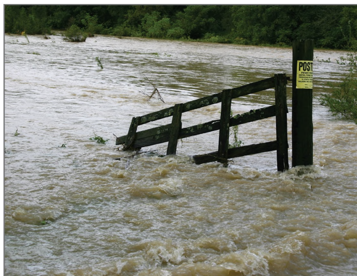
An Accessibility Impact of Severe Rainfalls

Emergency planning resources were discussed in both the context of physical resources as well as county-wide emergency response programs. When asked what type of physical resources individuals found essential, farmers (particularly dairy farmers) emphasized the importance of having access to a generator that would allow them to operate essential farm equipment in the occurrence of a power outage. Furthermore, farmers throughout the state discussed the importance of having equipment capable of clearing snow in the event that county transportation departments are unable to. Numerous dairy farmers relayed stories of being unable to ship milk due to road closures, and stressed the importance of having a backup plan in place.