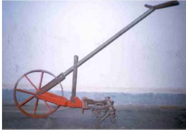
Fig. 2 (a) Developed Manual Weeder

code by using a stop watch. The field capacity of the weeder (ha/h) was calculated by fixing the area of 300 \text{ m}^2 ( 150 \times 2 \text{ m} ). The draft required by the weeder was calculated by using the equation (1). Weeding efficiency was worked out by using equation (2). The power input required for weeding operation was calculated by considering draft and traveling speed with equation (3). The percentage plant damage during field operation was calculated from equation (4). The performance of the weeder was assessed through performance index with the help of equation (5), suggested by Gupta (1981).