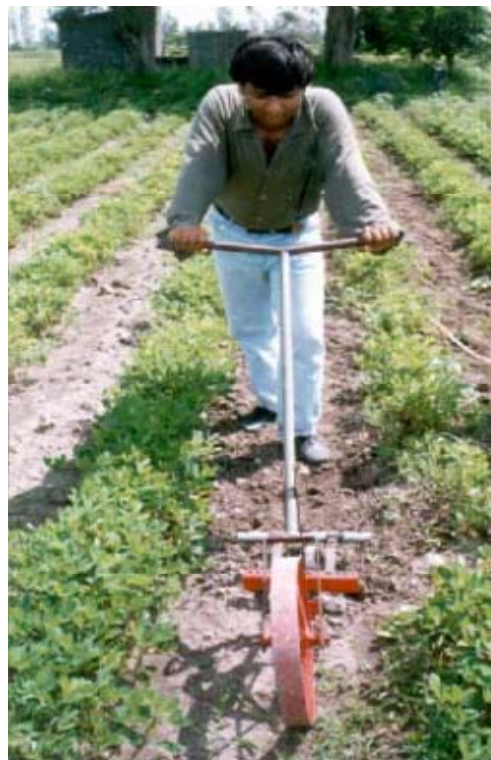
Fig. 2 (b). The weeding operation by developed weeder for groundnut crop