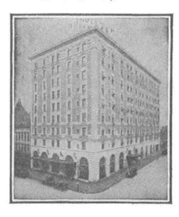
EUROPEAN PLAN Rooms $1.50 per day and up