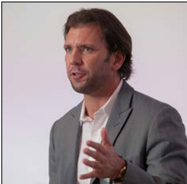
Carter Wilson: The hotels that you name in your competitive set should name you back. Most hotels have an “unconsidered set” of competitors.